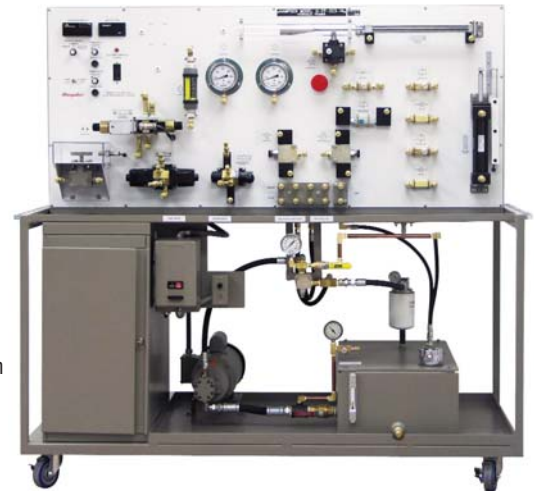
Hampden MODEL H-FP-223-14 Hydraulic Trainer Shown with EH Option Dimensions: 66"W x 65"H x 28"D Weight: 1,000 lbs.