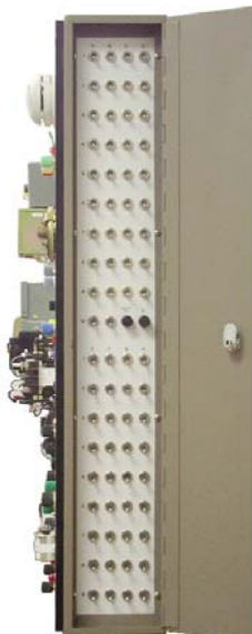
Right side view of H-ACCS showing Fault Switch compart- ment and lockable access door

The Hampden Model H-ACCS Air Conditioning Control System contains the actual components used in the control of commercial and residential heating/cooling systems. All components are prewired into a complete thermostat-actuated control system and then diagrammed to facilitate understanding and use.